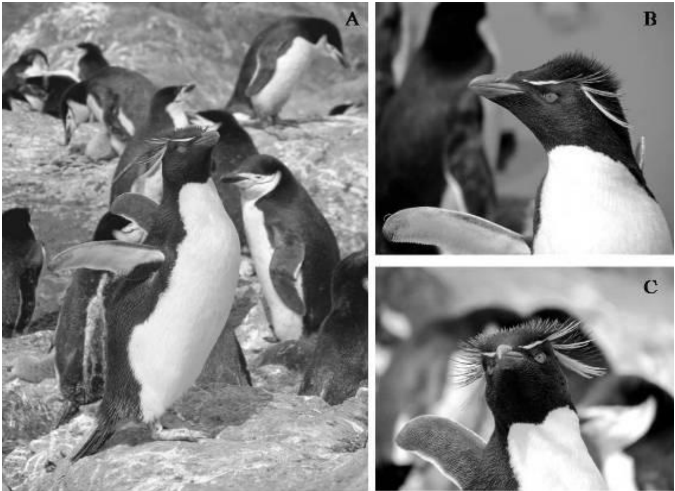
Figure 2. . Rockhopper penguin, Eudyptes chrysocome , observed on 8 January 2012 among chinstrap penguins, Pygoscelis antarctica , in Stinker Point, Elephant Island, South Shetland Islands; B and C – Morphological characteristics of the species that allowed species identification: straight bright and yellow eyebrow ending in long yellow feathers behind the eye, the top of the head has spiked black feathers (Birdlife International 2013).

breeding period (Péron et al. 2010, 2012, Petry et al. 2012). Such marine environmental changes which affect prey abundance (Ellis 1999) are, added to fisheries, the cause of a rapid decline of rockhopper penguin populations (30.8%) over the past 30 years, placing the species as Vulnerable (Birdlife International 2013). Every information about distribution may be useful to help understand the species situation.