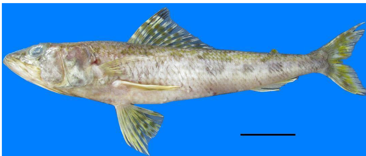
Figure 2. Aulopus filamentosus (ref. AUL-Fi-02) captured in Tunisian waters (scale bar = 50 mm).